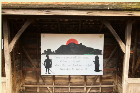
Display in the bus shelter for Holy Week

2 of the 1,500 snowmen put out in the parish the week before Christmas ( the 3rd year of putting out knitted items and messages and the 4th year ones are currently being produced!)