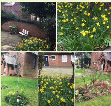
Spring at St Leonard's

Our usual Sunday Services at 10:30am & 5pm are up and running again in Church, as is the 10:30am Diddy Disciples group accompanied by their families. We will still be distancing for a while and have had to divide people up a little, but hopefully not for too long. We shall also be continuing with our online worship so do look at our website: www.wigginton-stleonard-stjames.org.uk or follow our Facebook page: Wigginton Parish, St Leonard's and Spital Chapel