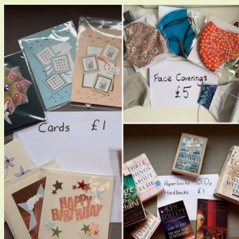
Items from the 'pop-up' sales

It has been great that Young at Heart have been able to remain in the Centre through most of the last year, and we are looking forward to the return of the Dance Group.